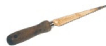
Fine Tooth Saw

Recommended tools for installing PlastiSpan HD Insulation