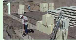
1 Footings and corner kickers in place; load the hole