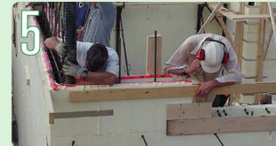
5 Top row complete – place and vibrate concrete