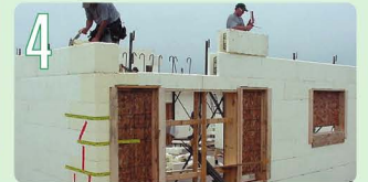
4 Place steel in walls and around openings