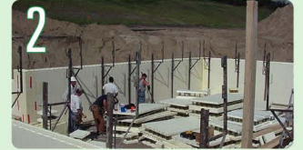
2 Install scaffolding when 3 to 4 courses high