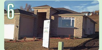
6 Finished Advantage ICF home

To view the Advantage ICF System Installation Videos visit: www.plastifab.com/homeowners -> "build your home" -> "educational/how-to"