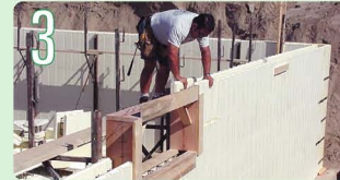
3 Set window and door bucks