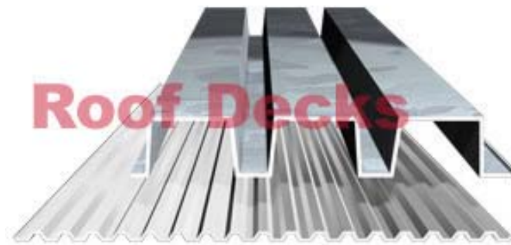
Figure 1 - Typical Metal Roof Deck

The purpose of this bulletin is to address PlastiSpan roof insulation minimum thickness when used over fluted metal roof deck as illustrated below.